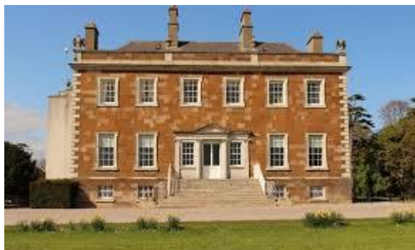
NEWBRIDGE HOUSE & FARM DONABATE, CO. DUBLIN

Staging will take place on Friday 30th June between 1 & 5pm